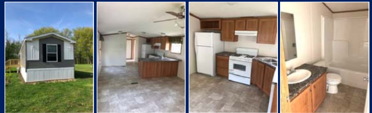
*Previous model photos shown; Actual model colors/decor may differ.