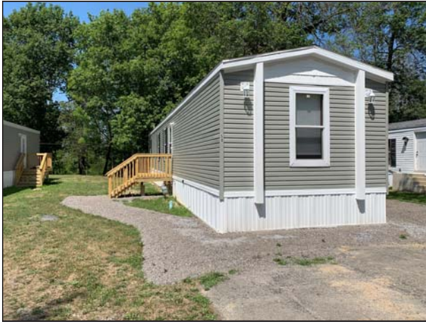
* Sample exterior photo. Model may differ.