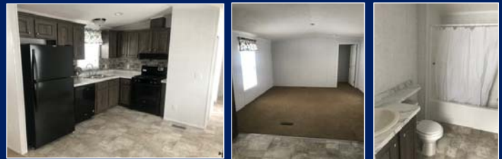
*Previous model photos. Actual home interior colors/decor may differ.