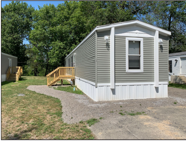
* Sample exterior photo. Model may differ.